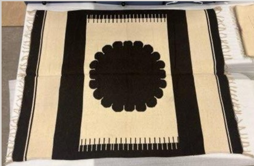
Unidentified Artist, Untitled , 83" X 60"