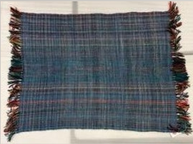
Unidentified Artist, Untitled , 64" X 48"

MEDIUM: WOOLEN WEAVINGS CREDIT LINE: DONATED BY MATT DURAN