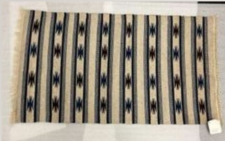
Marie E. Vigil, Rio Grande Blues , 47" X 26"