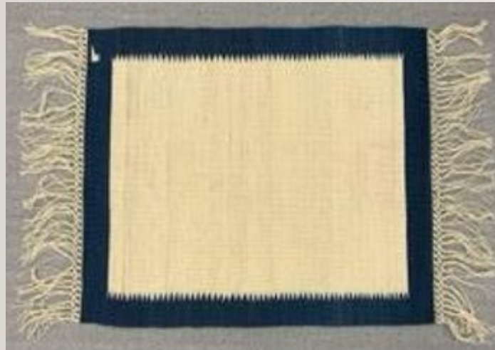
Unidentified Artist, Untitled , 11" X 10 1 / 4 "