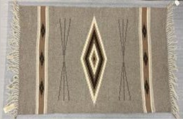
Unidentified Artist, Untitled , 43" X 31"