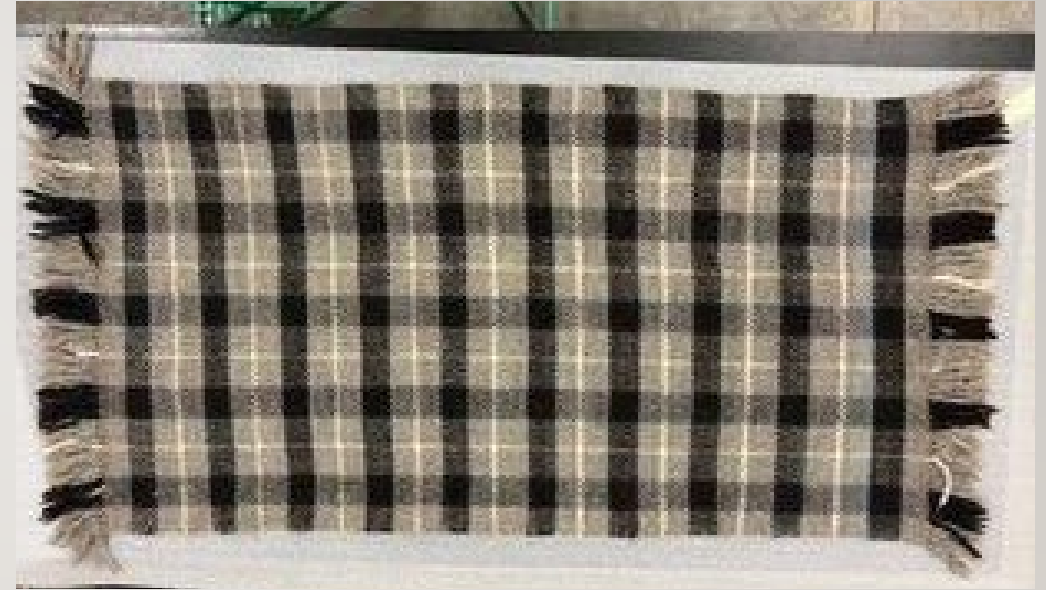
Unidentified Artist, Untitled , 63" X 29 3 / 4 "

MEDIUM: WOOLEN WEAVINGS CREDIT LINE: DONATED BY MATT DURAN