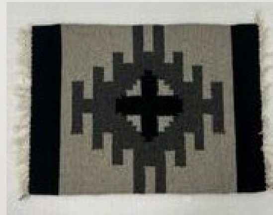
Victoria Lopez, Untitled , 25" X 17"